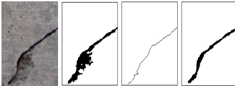
(a)original image (b)image after otsu segmentation( F(P,A)=0.0860 ) (c)middleline image (d)image after fractal optimization( F(P,A)=0.0447 )